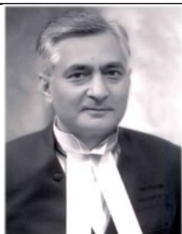
HON'BLE MR. JUSTICE T.S. THAKUR, CHIEF JUSTICE OF INDIA CUM –PATRON-IN-CHIEF, NATIONAL LEGAL SERVICES AUTHORITY